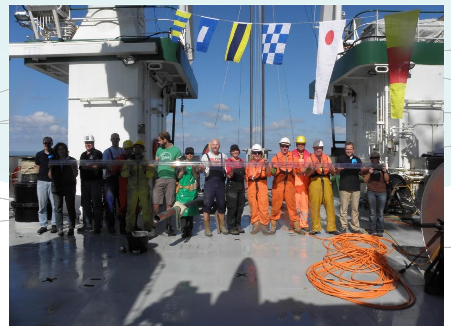
Scientists and crew celebrating successful vibro-coring survey!